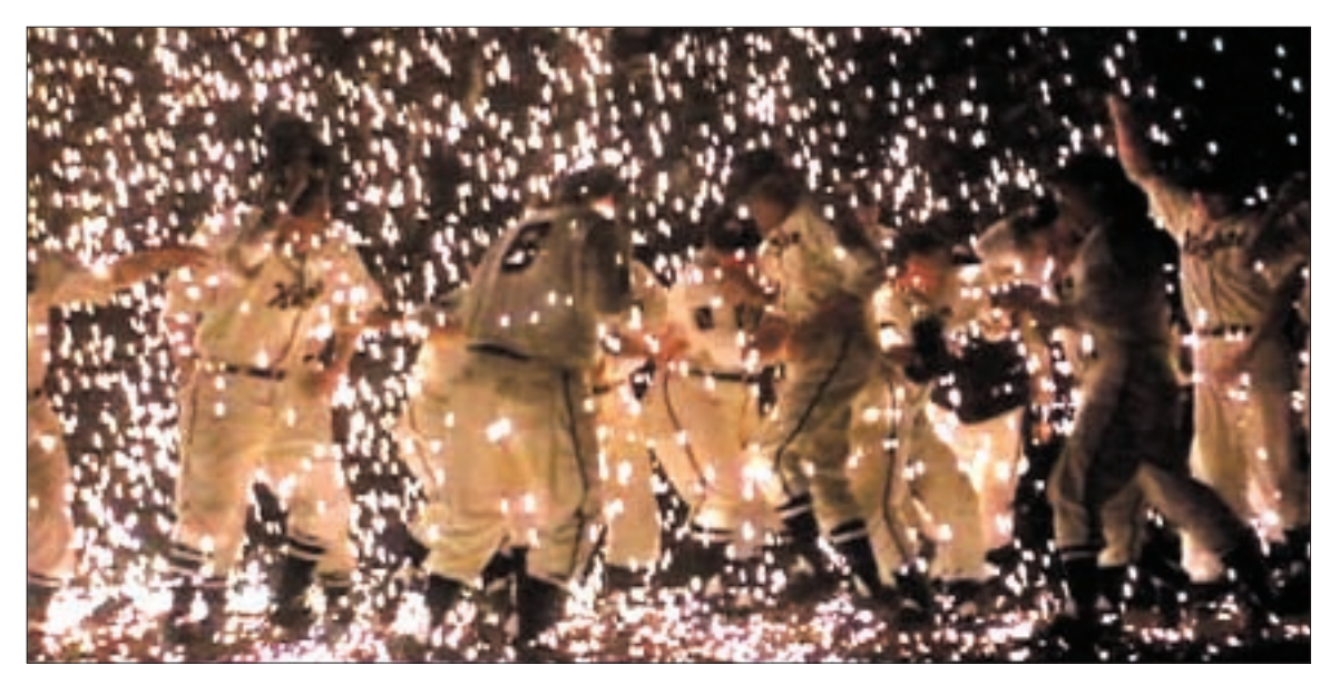
9.25. As Roy rounds the bases, the sparks from the exploding bulbs surround him and his jubilant teammates in a soft gentle wash of light-they are enveloped in an omnipresent glow of the power of pure good triumphant over evil — one of the most beautiful and haunting images in modern cinema. The light is non-directional — it is all around them, part of them, within them.

be a factor in underlying story points, character and particularly the perception of time and space. Filmmakers who take a rejectionist attitude toward lighting are depriving themselves of one of the most important, subtle and powerful tools of visual storytelling. Those who reject lighting are often those who least understand its usefulness and eloquence as a cinematic tool.