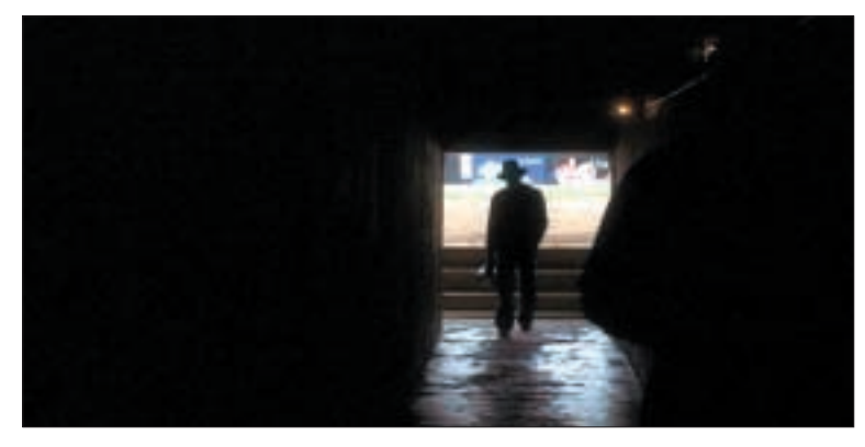
9.11. After years of foundering in the narrow darkness of obscurity, Roy emerges into the light of the one thing that gives him power — the bright sunny open space of a baseball field.

Their attempt at bribery having failed, they contrive to set him up with Memo (Kim Basinger, who always wears black) at a fancy restaurant, where the only illumination is the table lamps which cast an ominous underlight on the characters, although fill is added for Roy (purity) and Memo (raw beauty). She takes him to the beach and in a reprise of the love scene between Roy and Iris they are bathed in blue moonlight. But this is a slightly different moonlight than we saw with his boyhood girl: colder and harsher; sensuous, but not romantic (Figure 9.13). She comes to seduce him and she is completely in silhouette, sexy but still mysterious.