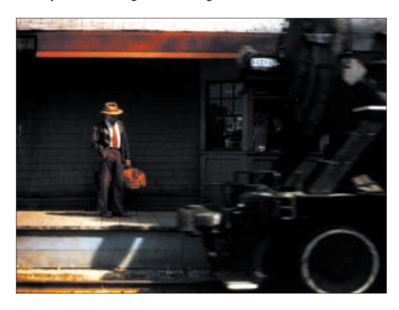
9.8 . The opening shot from The Natural — a faceless character lost somewhere in the light and the dark, suspended in time: the past is uncertain and the future is unclear. This purgatory of being caught between them establishes the mood and tone of uncertainty and conflict between two worlds that is carried through the rest of the film. ( The Natural , Tristar Pictures/RCA/Columbia, 1984.)

His father dies of a heart attack in the shade of a tree and that night there is a ferocious storm: inky blue punctuated with stabs of violent lightning. A bolt splits the tree and Roy uses the heart of the tree to make his own bat which he inscribes with a lightning bolt: a symbol of the power of nature: light in its most intense, primitive and pure form. He gets a call from the majors and asks Iris out for a last meeting. They are silhouetted on a ridge against a glowing ultramarine blue sky which represents night and the temptations of eros (Figure 9.9). If you look closely, it is completely unnatural (it's day-for-night with a blue filter) but beautiful and perfectly portrays their mental state. In the barn, as they make love they are engulfed in stripes of moonlight alternating with darkness: it is a radiant